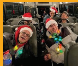
Social Hour with Friends

Eight people enjoy living in the Agency's newest home with gorgeous environs and private outdoor space.